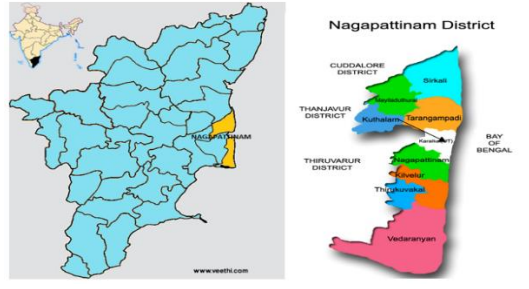
Figure.1. Location map for Nagapattinam District

Nitrate content in water samples are varies from 32.8 in Valluvur village to 481.22 in Vanagiri. 88% of the sample exceeds the safe limit of 50 mg/L recommended by WHO (2012). The excess of nitrate may cause blue baby syndrome. Sulphate concentration in water is initiated to vary from 3.2 mg/L in Mahili to 289.7mg/L in Katthiripulam. The concentration of phosphate shows between 0.01 to 4.68mg/L. In many samples the concentration of phosphate and sulphate are originated to higher than acceptable limit of 0.05 and 250 stated by WHO (2012). The concentration of Chloride found to vary from 40 mg/L in Thillaiyadi to 5298 in the village Mudaliyappan kandiyur, whereas the Fluoride Concentration lies in between 0.1 in Kachchanagaram and 2.0 in Kaththiripulam. Ayakkarambalam I setti and Katthiripulam have higher value of fluoride.